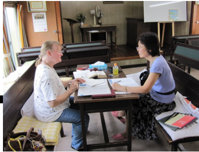
Teaching English Bible to neighbors Through LST (Let's Start Talking)