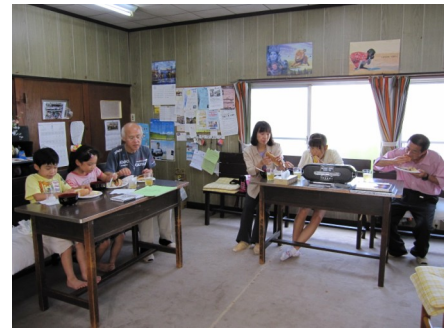
July 4th Independence Day Party LST Fun, Food, and Fellowship