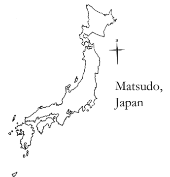
Proclaiming the Gospel Message in Central Japan