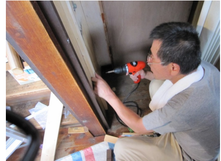
New “accordion door” for toilet