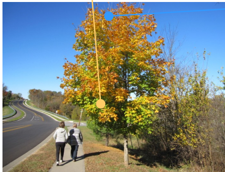
Taking a long walk in Missouri