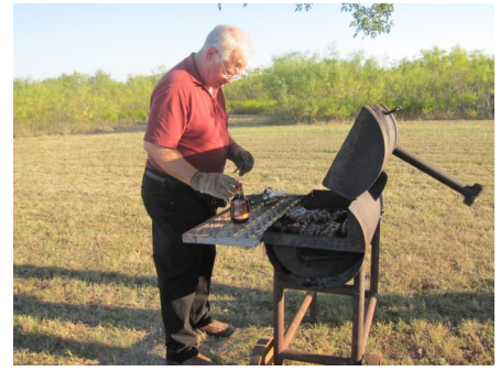
Barbecuing in Abilene, Texas