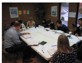
Asian Bible Class at Red Bridge

and done well, now providing Bible lessons for Chinese, Taiwanese, Korean, and Japanese students in English. We pray that in the future, these opportunities may flourish for us and for the church there.