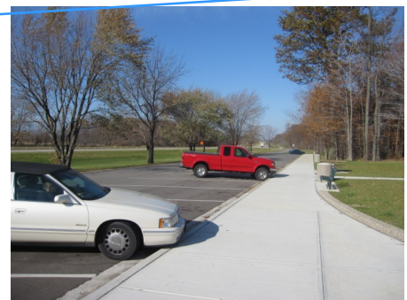
Pausing for a Rest Stop in Michigan