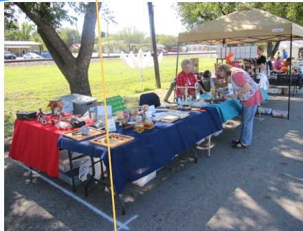
Pecan Festival in Clyde, Texas