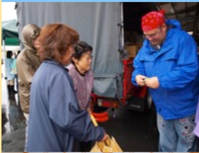
(Below) With the counselors, volunteers & new friends in Ishinomaki