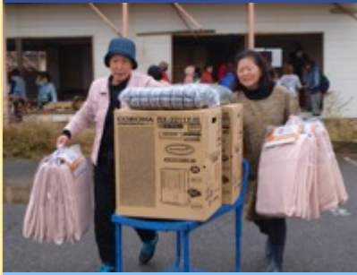
(Above & Middle) Distributions in the rain, sun, and cold: heaters, blankets, warm clothing & food