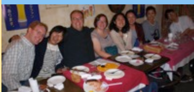
(Below) Mito church young adult fellowship at a restaurant in town